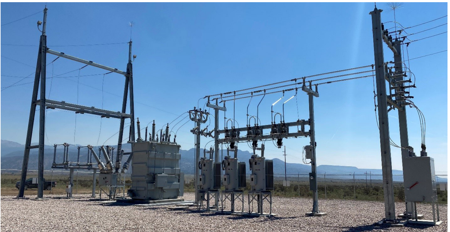
The newly constructed Acoma electrical substation

Avant Energy supported POAUA throughout the entire electric utility formation process. Avant provided feasibility studies, economic analysis, facility design, and construction consulting as the project progressed. Avant also assisted POAUA in obtaining financing for the project. To support the utility's daily operational needs, Avant developed policies, practices, and procedures to ensure POAUA could operate its new utility using industry best-practices.