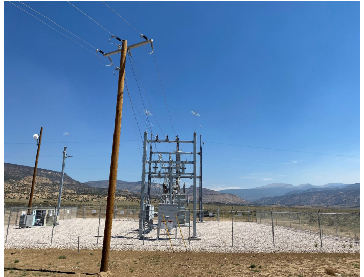
Mount Taylor in the background and the transmission outlet leading to Acoma Pueblo lands

"The Pueblo of Acoma Tribal Council took a significant step in exercising its sovereignty by establishing the electric utility that will ensure full management and control of our resources for Acoma people today, and future generations. This milestone will nurture and drive future community and economic development on Acoma Pueblo lands." - Governor Brian D. Vallo